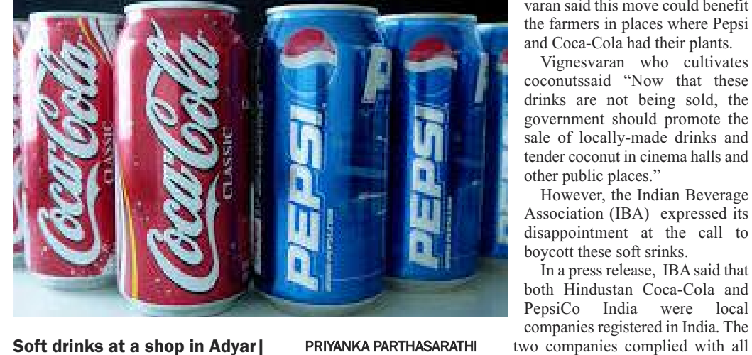
shopkeepers about the ill-effects of Soft drinks at a shop in Adyar

Some are now planning to come up with new ideas for drinks. "We have already introduced lemonade in our store," Manoj adds.