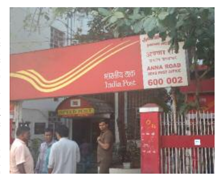
The Head Post Office on the Mount road

"Once the centres start functioning, the passport services will be available in Vellore and Salem. At present, people have to travel to Chennai and Coimbatore [to get the passports]," said Mr