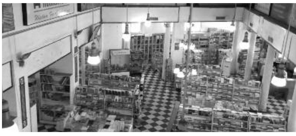
Higginbothams..all set for a makeover

full-time into revamping the shop." Explaining the modus operandi of the renovation work, he said, "We've paid special attention to the heritage aspect of the building, retaining the original exterior structure and fully restoring the damage caused by wear and tear over the years."