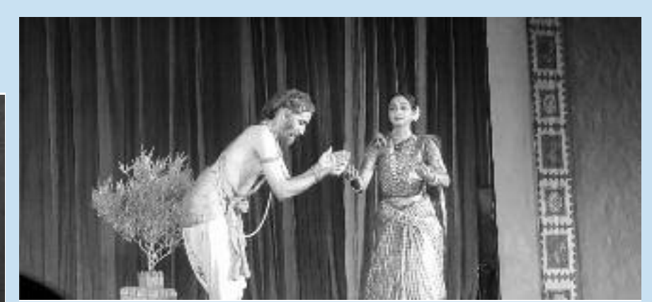
The story of 'Siri purandara' was performed at the festival