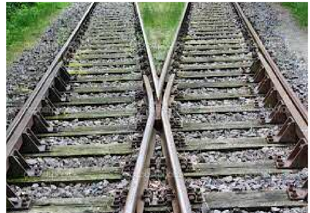
Joints are where cracks are most likely to develop

Southern Railway boasts of a large train network and most of the tracks in the network are old and outdated which act as an obstacle to the smooth operation of trains and often results in speed restrictions.