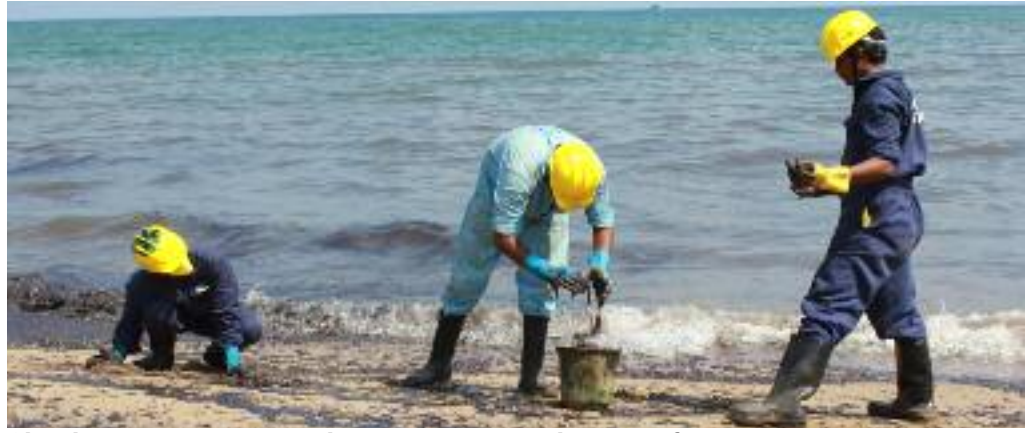
Oil spill cleanup on the Marina Beach kept tourists away for three weeks I UTSAV T