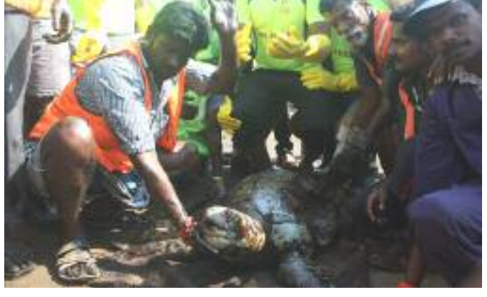
People rescuea tortoise covered in crude oil.

"It will take us another week to complete the clean up," said P.