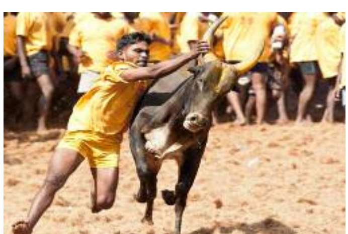
Jallikattu in Avavniapuram near Madurai.

The Government had amended the Prevention of Cruelty Act to appease protesters who were opposing the ban on jallikattu. The protest turned violent after the