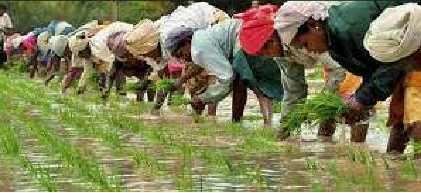
Will the farmers get credit in time for a good crop?

However, the sentiment in the automobile sector suggests that these measures to lay new highways and to provide better last mile connectivity would have been beneficial to the commercial vehicles segment if the cash-dealing restriction hadn't been introduced.