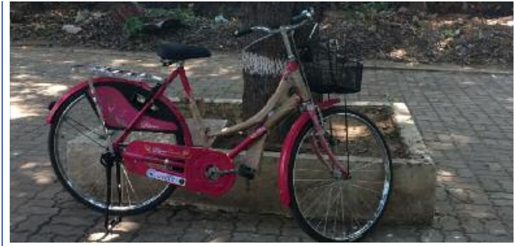
The lone bicycle at Ekkatuthangal Station in Chennai

"I admit smilingly that I have been a failure," he said, adding that whenever officials or politicians visited any place they would be flanked by security. "Fear is the reason for the failure of administration," he added.