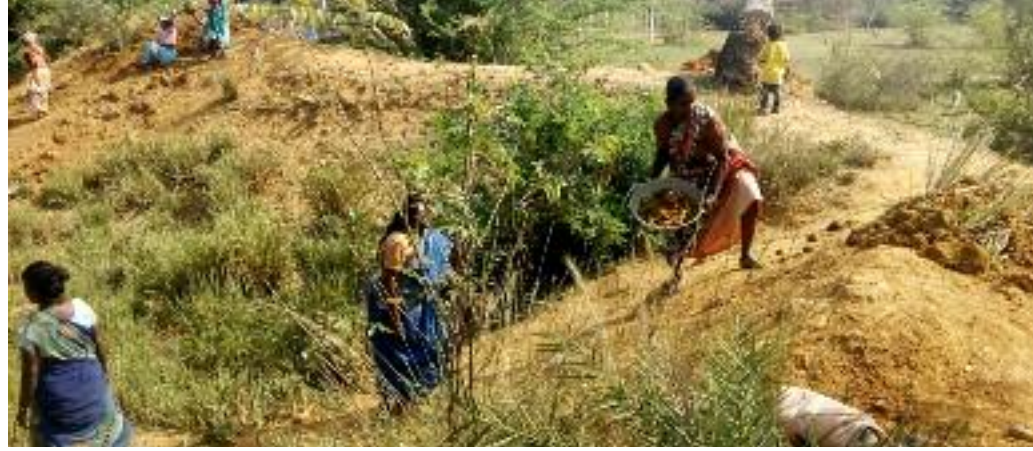
Farmers employed under MGNREGA scheme in Tiruvallur

"Announcing new initiatives and not following up on the older schemes will prove to be quite a