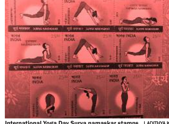
International Yoga Day Surya namaskar stamps | ADITHYA K

"A lot of schools turned us away when we went to them to talk about stamp collecting saving that it will just waste the children's time," says Mahesh. With more and more pressure being mounted on children and youngsters academically and