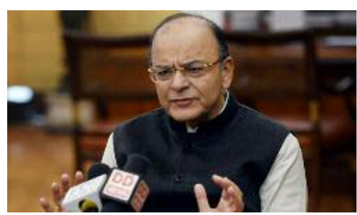
Finance Minister Arun Jaitley briefing the media

With the hope of bringing more people into the tax-paying net, the salaried middle class, earning