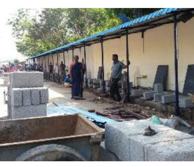
Temporary stalls at Nadukuppam.

"I have been running this business since 2000, and earning between Rs 700 and Rs 800 in a day. Now only four or five people buy ice cream," he added.