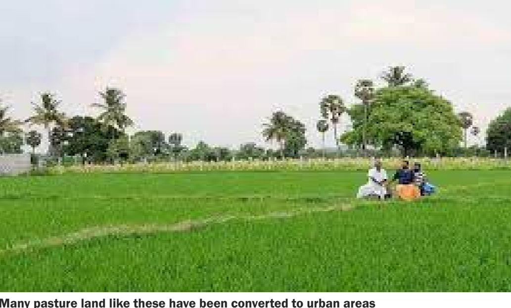
Many pasture land like these have been converted to urban areas

To find out exactly how much urbanization has eaten up southern Chennai's green spaces, scientists in Madras University's Department of Applied Geology used remote sensing and GIS techniques to analyse the extent of land use and its changes from 1990 to 2005. They found that areas of human habitation increased by more than